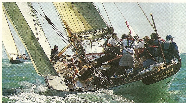
Clockwise from top: Cowes, the epicenter of yachting in England, was dressed in its finest for the Jubilee; Onawa , the oldest American 12 Meter, completed a full restoraton just in time to board a ship for Cowes; Britain's Princess Anne and Prince Phillip were among the many A-list guests at the event.

the America's Cup Hall of Fame induction dinner in the company of many of the world's best-known yacht designers, most of whom were not yet born when he drew his first Cup winner; billionaire Bill Koch bidding a half-million dollars for a few cases of rare cognac at the glittering Jubilee ball; the relentless thud of cannon fire at the Squadron signaling class finishes; the beautiful Js charging downwind under spinners that could drape a two-story house.